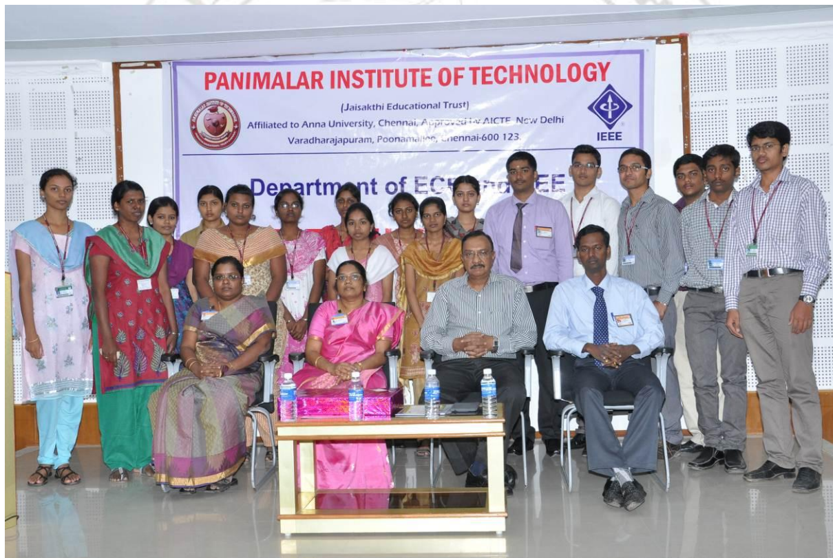
PIT IEEE SB Inaugral function.